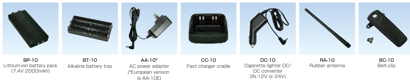
BP-10 Lithium-ion battery pack (7.4V 2000mAh)